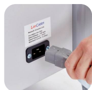
IEC socket with 1.8m designed to snap out if pulled away.