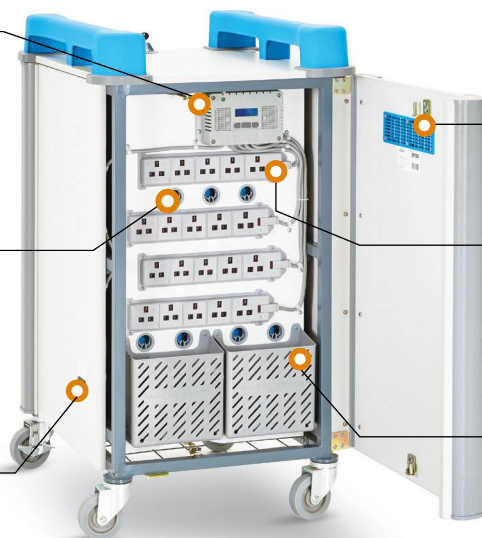
Well placed vents allow constant air circulation.