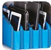
Devices stored vertically in protective storage on sliding shelves.