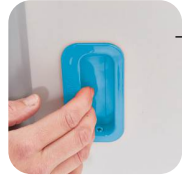
Inset door handles.