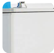
Strong MFC cladding.