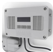
Power 7 Management System manages the power consumption.