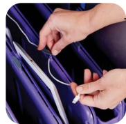
Cleverly integrated twisting cable clips to ensure cables stay in place.