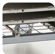
Fully welded steel frame with weldmesh base for constant air flow.