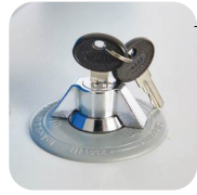
Dual point locking Key system.