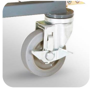
Non-marking hospital grade rubber wheels.