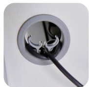
Cable clip portholes feed cables.