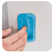
Inset door handles.