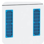
Well placed air vents to the rear and base.