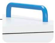
Easy grip handles make it easy to manoeuvre.