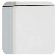
Strong MFC cladding.