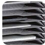
1.2mm grey steel fixed shelves with ventilations.