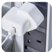
Device adapters plug into 2x10-way powerstrips.