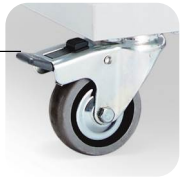
Non-marking hospital grade rubber wheels.