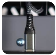
Easy cable management system.