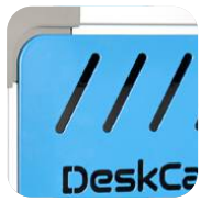
Integrated air vents.