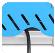
DeskCabby IEC power cable plugs into the mains.