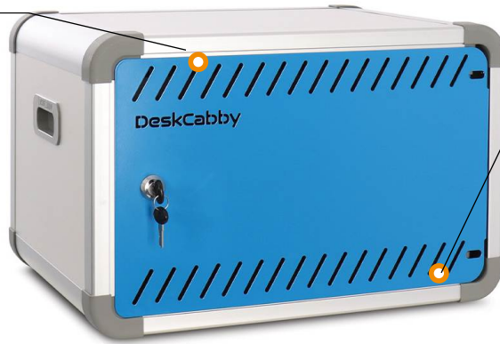
LED display indication lights.