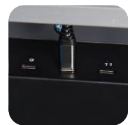
USB cables are connected in the rear locked compartment.