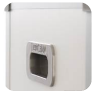
Inset handles on each side allow easy lifting.