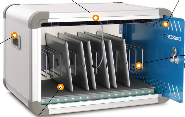
Easy removal of device rack and neoprene mat for easy cleaning.