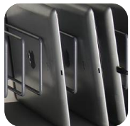
Individual vertical charging compartments.