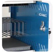
Retractable front door allows full access to devices.