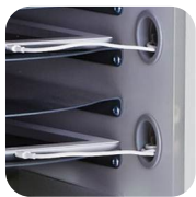
Cable clip portholes to gether excess cables.