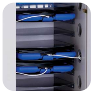
Individual fixed shelf compartments.