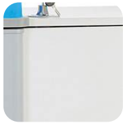
Strong MFC cladding.