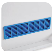
Well placed vents allow constant air circulation.