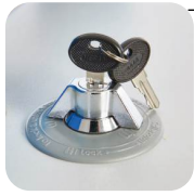
Dual point locking Key system.