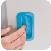
Inset door handles.