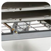
Fully welded steel frame with weldmesh base for constant air flow.