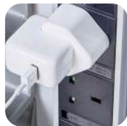
Device adapters plug into 2x10-way powerstrips.