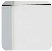
Strong MFC cladding.