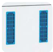
Well placed air vents to the rear and base.