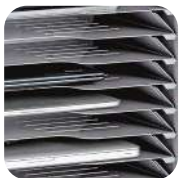
1.2mm grey steel fixed shelves with ventilations.