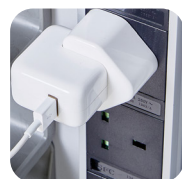
Device adapters plug into 2x8-way powerstrips.