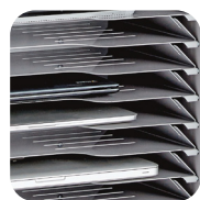
1.2mm grey steel fixed shelves with ventilations.