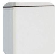
Strong MFC cladding.