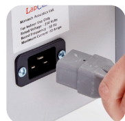
IEC power cable into the mains.