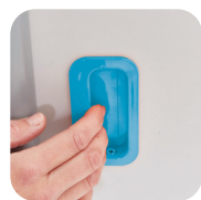
Inset door handles.