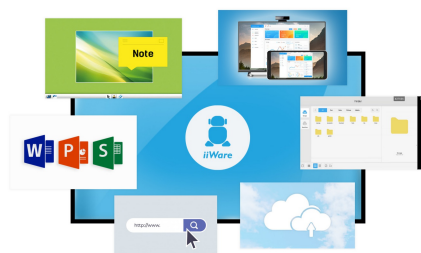
iiWare 8.0 (Android OS)

Share, stream and edit content from any device directly on screen and transform your team meetings or lessons into an easy, fast and seamless interactive session with the included WiFi module ( OWM001 ) and the ScreenSharePro app.