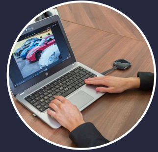
Connect to CleverCast with one tap