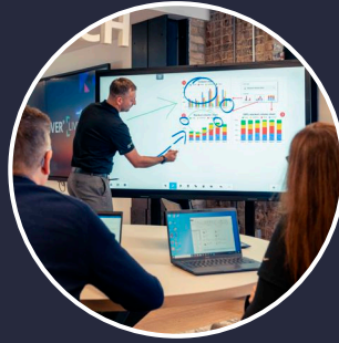
Enhanced Boardroom Collaboration