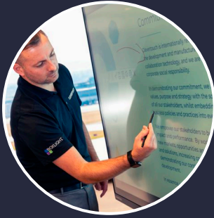
Collaboration Tools at your fingertips